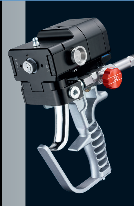
WIWA PU GUN 4040 manual gun