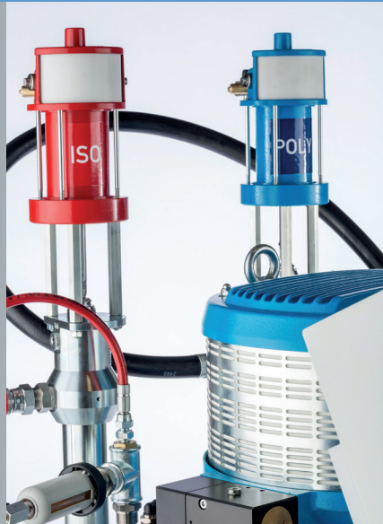
WIWA DUOMIX PU 540 with feed pumps