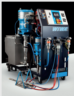
WIWA FLEXIMIX 2 electronic plural component spray equipment