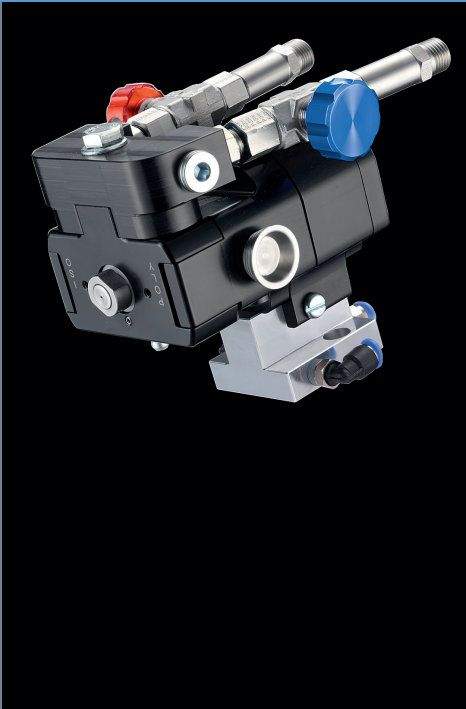
WIWA PU GUN 4040 automatic gun