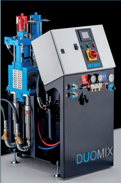
WIWA DUOMIX PU HYDRAULIC