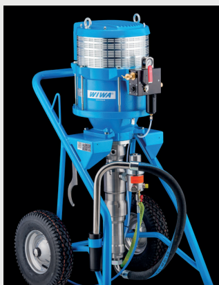
WIWA HERKULES 333 GX, single feed (airless) spray equipment