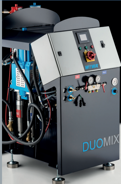
WIWA DUOMIX PU HYDRAULIC - with hose rack