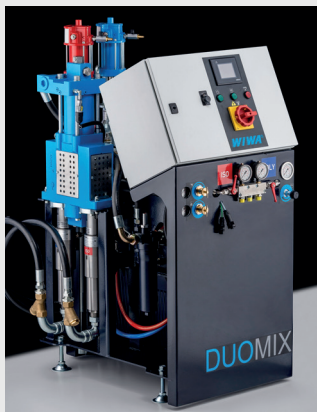
WIWA DUOMIX PU HX, hydraulic plural component spray equipment