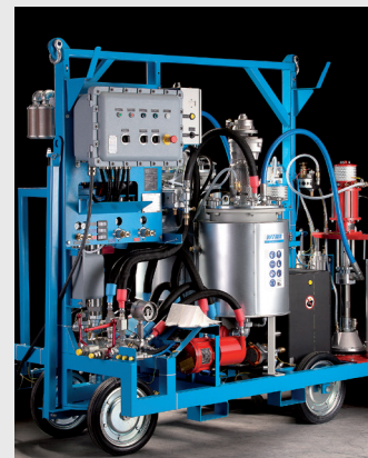
WIWA DUOMIX 333 PFP ATEX, for intumescent fire protection material