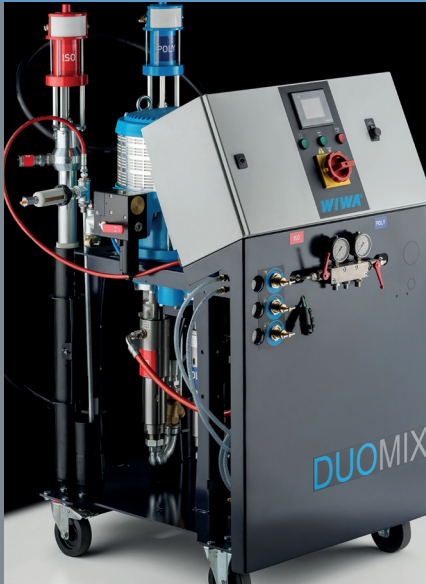
WIWA DUOMIX PU 540 on cart