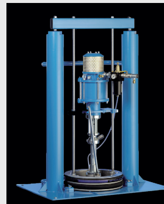
WIWA VULKAN, pneumatic extrusion equipment